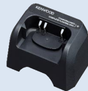
KSC-50CR [W] CHARGER POCKET