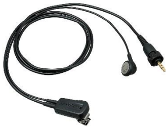
EMC-13 [W] CLIP MICROPHONE WITH EARPHONE (STD)