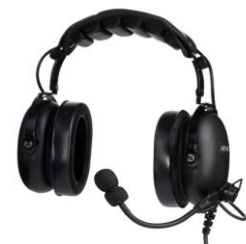
KHS-10-OH-SD HEAVY DUTY HEADSET