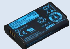
KNB-81L [W] Li-ion BATTERY PACK (3.6 V/2200 mAh)