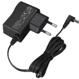
KSC-44SL [E] AC ADAPTER (EU Plug) (SINGLE)