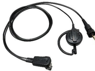
EMC-14 [W] CLIP MICROPHONE WITH EARPHONE (EAR-HANGING)