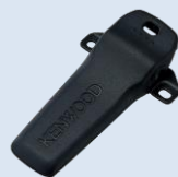
KBH-14 [M] BELT CLIP (Short)