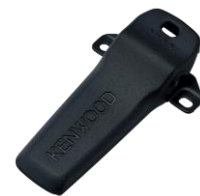
KBH-14 [M] BELT CLIP (Short)