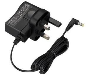
KSC-44SL [T] AC ADAPTER (UK Plug) (SINGLE)