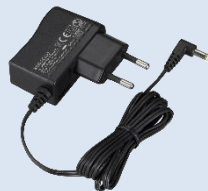
KSC-44SL [E] AC ADAPTER (SINGLE)