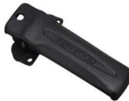
KBH-21 [W] BELT CLIP (50mm)