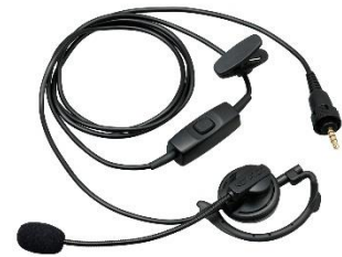
KHS-37 [W] HEADSET (EAR-HOOK)