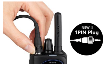
New 1-pin SP-Mic connector Pin compatible with ProTalk FD WD-K10srs