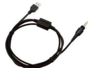
KPG-186U [W] USB PROGRAMMING INTERFACE CABLE (1-pin)