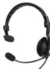
KHS-7A-SD SINGLE MUFF HEADSET