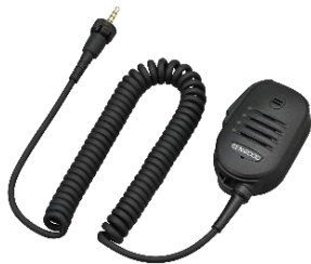
KMC-55 [W] SPEAKER MICROPHONE (IP54/55/67, PF Key, 2.5 D EP Jack)