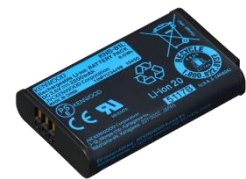
KNB-81L [W] Li-ion BATTERY PACK (3.6 V/2200 mAh)