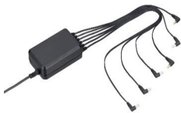
KSC-44ML [M] AC ADAPTER (EU Plug) (for Multiple Connected Charger up to 6 units) [AC plug may vary depend on the region]